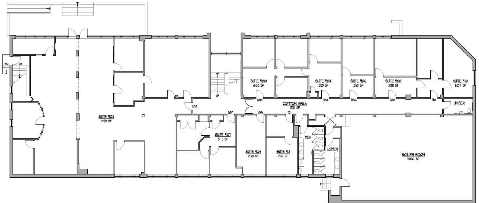
FIRST FLOOR PLAN SC: 1/8"=1'-0"

CENTERCO PROPERTIES 8008 CARONDELET AVE, ST. LOUIS, MISSOURI